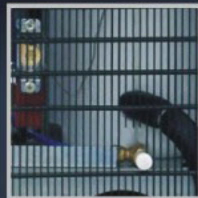
Cold tank drain