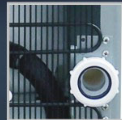
Plumbed-in waste facility