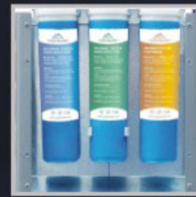
Filter storage compartment (Filter optional)