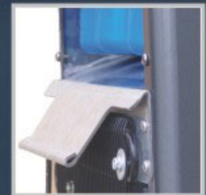
Inset carrying handle